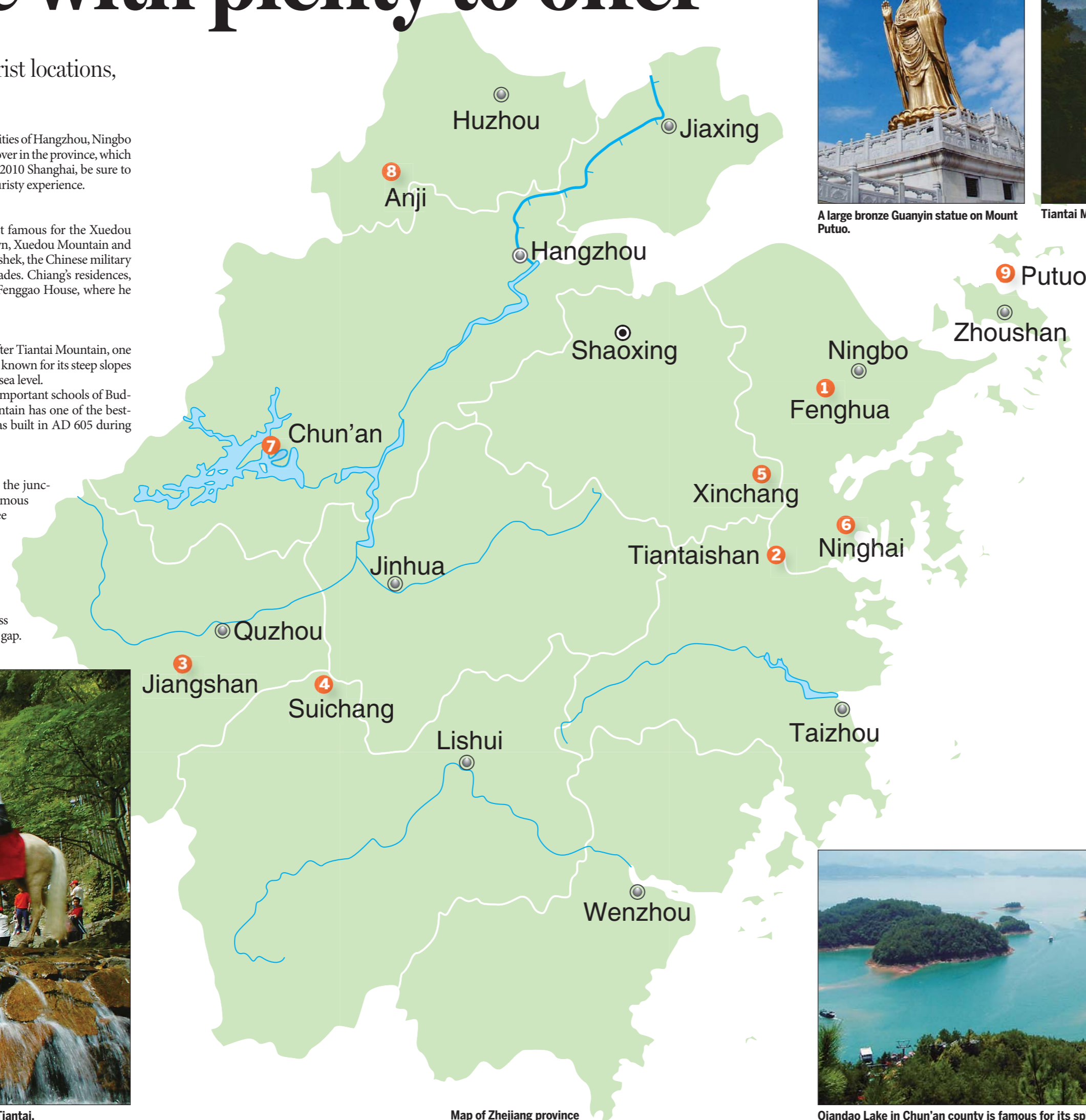
Map of Zhejiang province