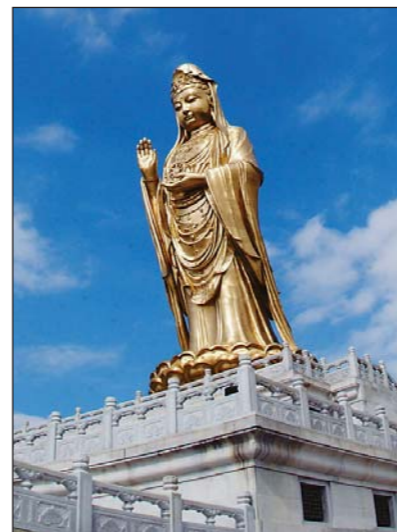
A large bronze Guanyin statue on Mount Putuo.