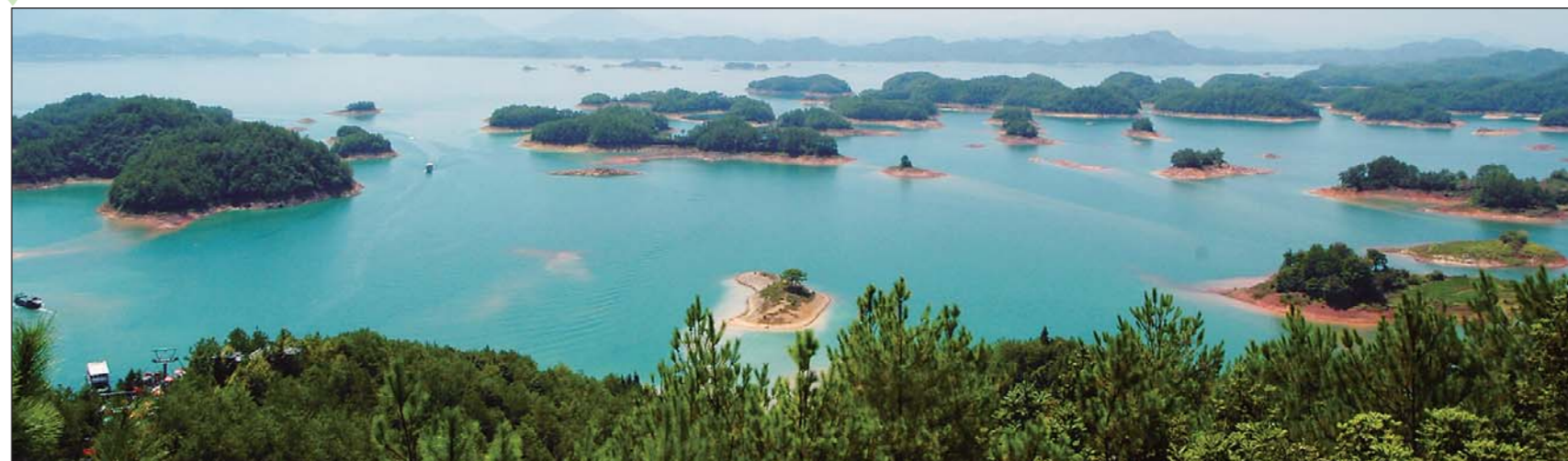
Qiandao Lake in Chun'an county is famous for its splendid scenery and crystal-clear water.

Putuo is a district of Zhoushan, which is located in the northeast of the province. The district is named after Mount Putuo, which is one of four sites in the country considered sacred by Buddhists. But Mount Putuo is the only Buddhist mountain on an island. Putuo is home to many temples and monasteries that attract monks and nuns from all over the country and abroad, who come to live and practice their religion.