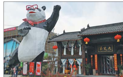
A street in Fanhuali commercial town, Baiyun district in Guiyang, features a giant panda statue and a more than 380-year-old traditional house.

A total of 1,500 impoverished households in the district received a 3,000 yuan dividend before Spring Festival this year.